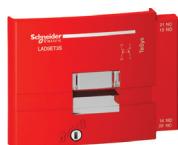
LAD9ET3S 80A to 95A