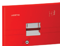
LAD9ET4S 110A to 150A